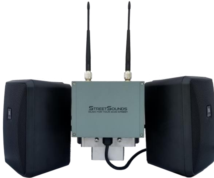
Figure 1 STS-170-205J Remote Unit

The speakers have some degree of adjustment so that they can be aimed in the desired direction. They should be mounted with a down-tilt of 5 – 10 degrees to keep rain from collecting inside. The speaker cable gland (rear protective cover for speaker wire connection) should be oriented at the top of the speaker. Please see the Support page of our website for information on how to adjust the speakers.